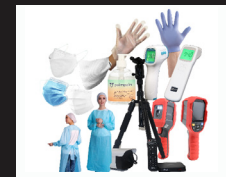
Healthcare & PPE