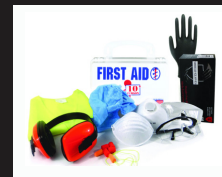
Safety & Gloves