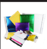
Poly Bags, Mailer, & PLEs