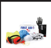
Safety & Gloves