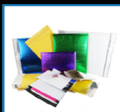
Poly Bags, Mailers, & PLEs