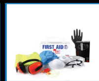
Safety & Gloves