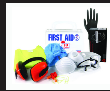
Safety & Gloves