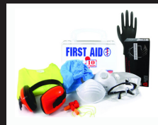
Safety & Gloves